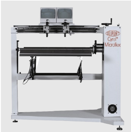
DuPont™ Cyrel® Microflex 850