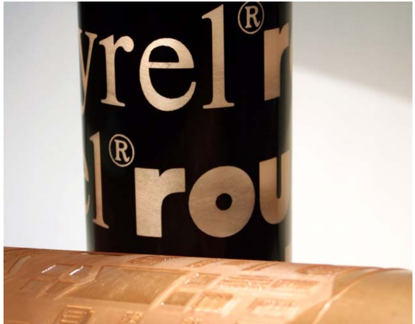
DuPont Cyrel® round Thin